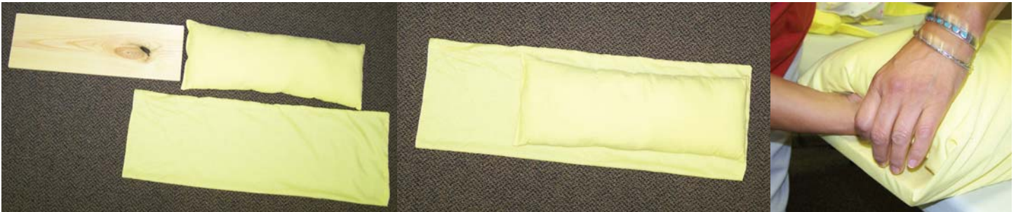
Board, pillow. and casing